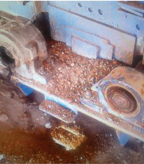
The Timken housed unit displaced a competitor's product (above) in a hammer mill operated by Hanson Brick.

Timken spherical roller bearing solid-block units feature cast-steel housings and durable seals. They provide robust protection from particulate contaminants and severe shock loads, while handling up to \pm 1.5 degrees of misalignment.